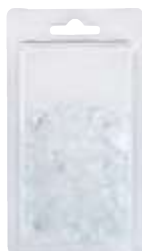
POLYPHOSPHATE CRYSTALS 6/10 (small) 160 g blister, refill TO DOSAL.