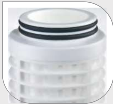
CX Quick-fit configuration with 57 mm double o-ring collar. Fit to Plus 3P CX and K DP housings.