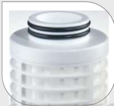
BX Quick-fit configuration with 45 mm double o-ring collar. Fit to Plus 3P BX housings, DP housings, K DP housings, Depural® Top, Bravo DP, Oasis DP.