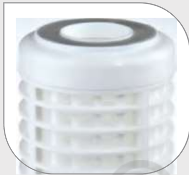
SX Standard double open end (DOE) configuration with antimicrobial flat seals. Fit to SX housings, DP housings, Depural®, Depural® Top, Bravo DP, Oasis DP.