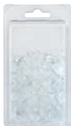
POLYPHOSPHATE CRYSTALS 6/10 (small) 160 g blister, refill TO DOSAL.